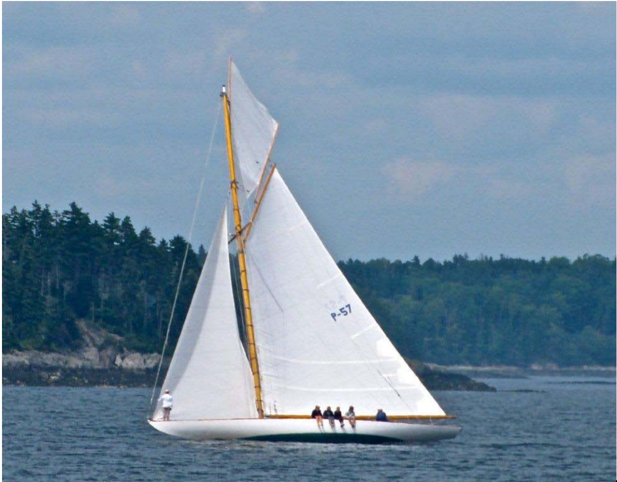
oyant : 58' Herreshoff sloop built in 1912 in Castine Classic Race