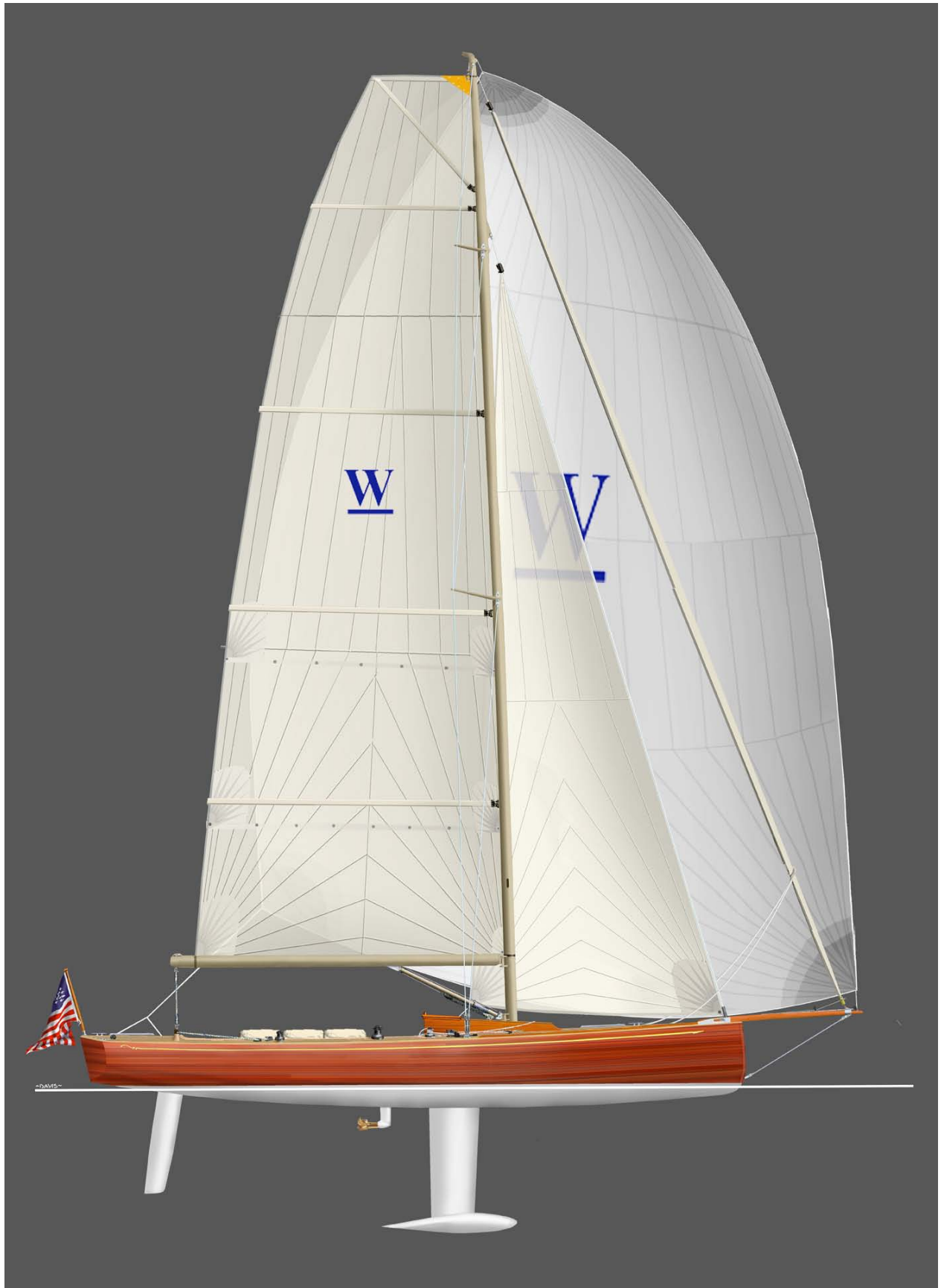
Race Horse: W-37 pure racing daysailer 2010