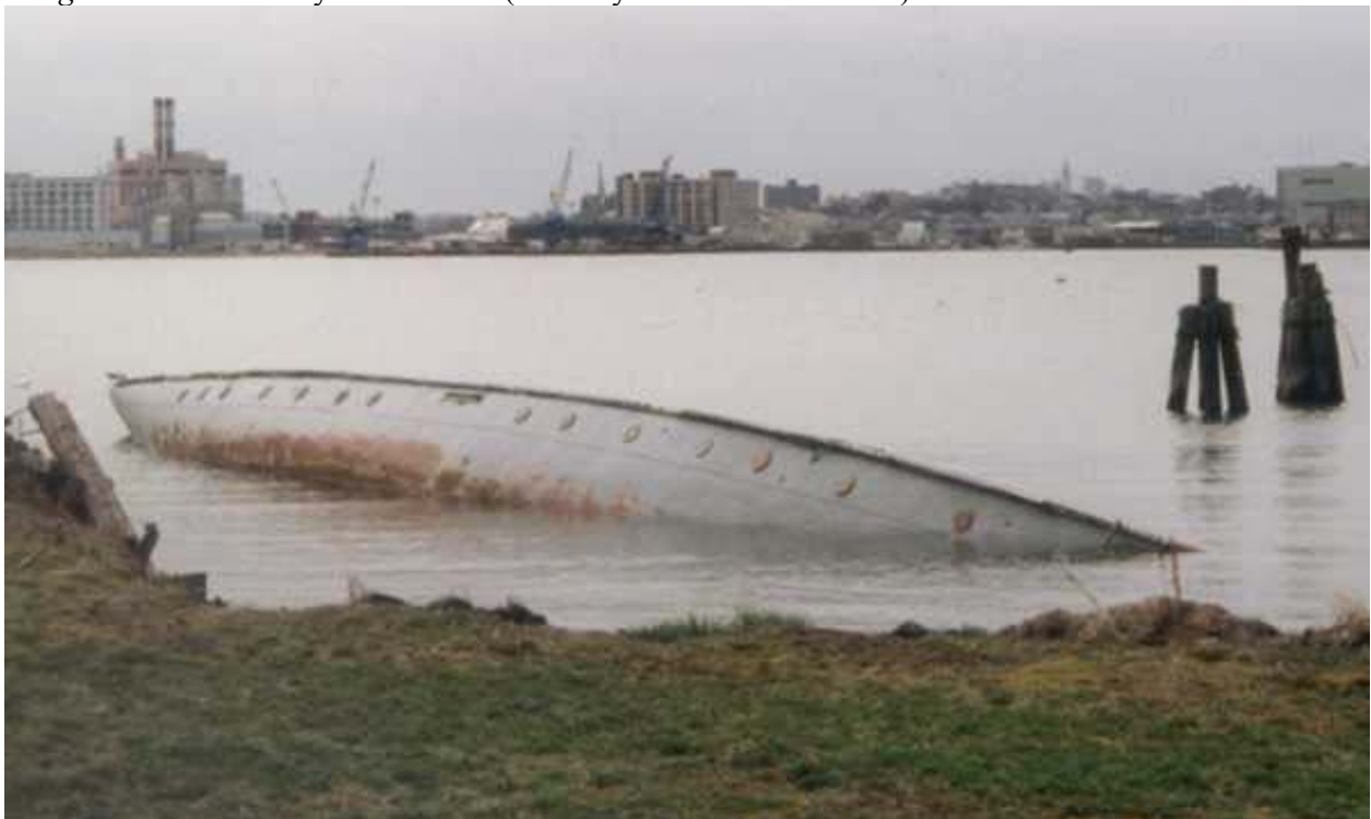
Cangarda : Sunk in Boston Harbor in 1999